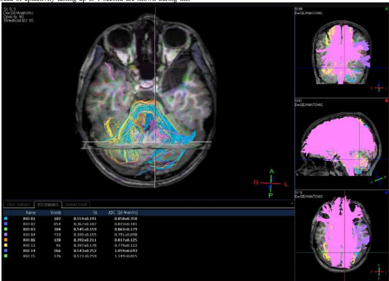
Figure 2: Diffusion tensor MR imaging findings before treatment.