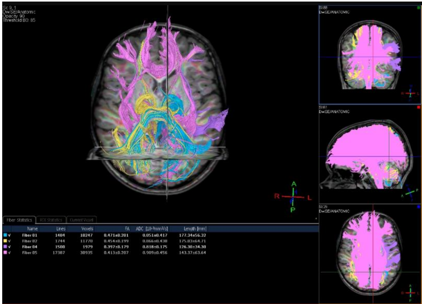
Figure 3: Diffusion tensor MR imaging findings before treatment.