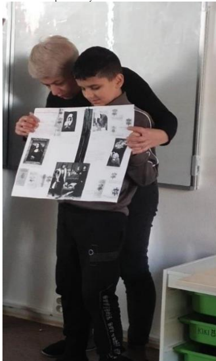
Figure 1: Mother and child during the school classes.

From the age of 9 years, child began attending a specialized educational institution. The patient's skills of writing and reading were gradually developing. At the age of 10 years, child had a consultation with a local psychiatrist and the treatment scheme was corrected: Depakine chrono-300 was prescribed ½ tab. 2 times a day for continuous administration, after which the mother reported some positive dynamics in child's communication skills. Subsequently, child's therapy with Depakine chrono had been taken as a life-long prescription. The child attends inclusive program at school; mother is the child's assistant at school (Figure 1).